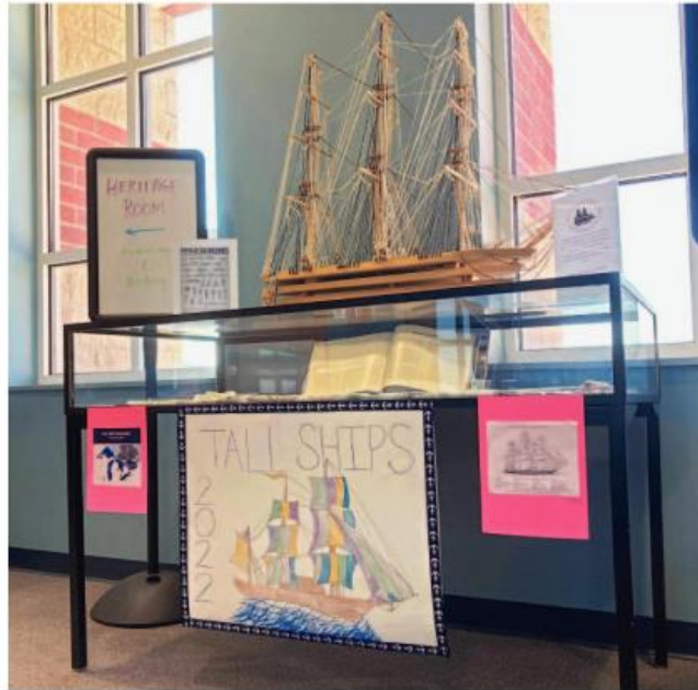
A model of the U.S. Brig Niagara and a tall ships display outside of the Blasco Library’s Heritage Room on Thursday.

The festival will have a lineup of about 20 artists performing a variety of live music, from acoustic to pop, jazz to folk and classics to sea shanties. Sabatini said the festival sought out local artists.