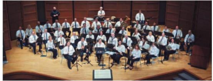
The Gem City Concert Band, shown here in 2015, and the Gem City Jazz Band will perform a concert on Nov. 5 in Blasco Memorial Library's H.O. Hirt Auditorium.

"Star Wars: The Empire Strikes Back in Concert": Saturday, 8 p.m., and Sunday, 3 p.m., Warner Theatre, 811 State St. Erie Philharmonic joins forces with John Williams' legendary score to perform "Star Wars: The Empire Strikes Back in Concert." The iconic movie will play on the big screen at the Warner while the orchestra performs the score live both days. $10 to $56 plus fees. 814-