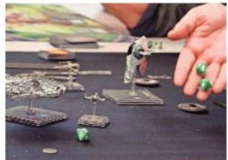
Gamers play Star Wars X-Wing at the Erie Library Comic Con in 2016. Now known as LIBCON Erie, the 2023 event will include the opportunity to create your own board game.