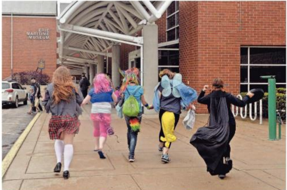
Participants attend the first Erie Library Comic Con in 2015 at Blasco Library. Now known as LIBCON Erie, the 2023 event will run April 24-29.

Mario Planter: April 25, 6-7 p.m., Iroquois Avenue Branch Library, 4212 Iroquois Ave. Make a piranha