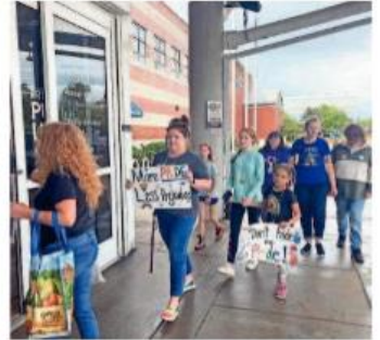
Members of the public enter Blasco Memorial Library on June 26 to participate in a staged "Bring Pride Back" read-in inside the children's library.