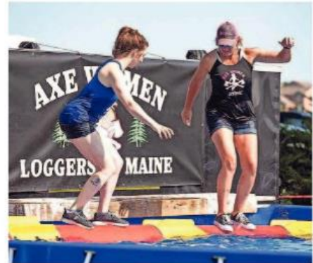
Axe Women of Maine will perform at North East Heritage Days this Saturday and Sunday.