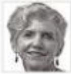
Your Turn Kathy Dahlkemper Guest columnist

It has been months since we first heard of the leasing of over 3,000 square feet of space within the Erie County Blasco Library to Gannon University for their Project NePTWNE. As with most Erie County residents, I believe Project NePTWNE is a worthy endeavor and can benefit our community. Yet, like many residents, I believe the Blasco Library is the wrong location for this project. I have heard arguments that the library use of space is changing and, somehow, allowing Gannon to occupy this large section of the library will benefit the library's future. From my years as County Executive of Erie County, I believe this could not be further from reality.