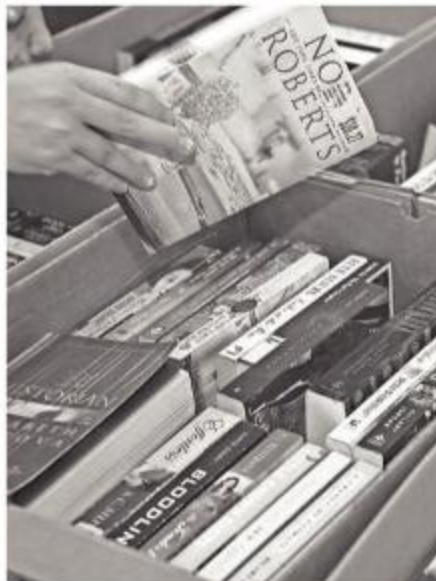
A shopper looks through the fiction section at the Great American Book Sale at Blasco Memorial Library in Erie.

The Friends of the Erie County Library accepts the following types of donations: